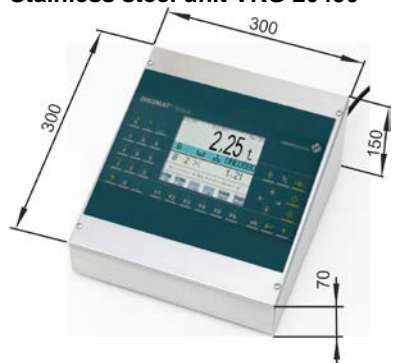
Table-top mounting Protection class: IP65